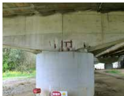
Atmospheric carbonation induced corrosion