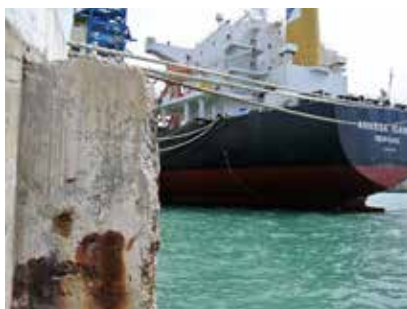
Chloride induced corrosion from sea water or de-icing salts

The most common causes of steel reinforcement corrosion in concrete are carbonation or chloride ingress with water. Understanding the root cause of this steel corrosion determines the most effective repair and protection strategy. Sika's Total Corrosion Management systems then provide flexibility and choices to select the best and most cost effective solutions.