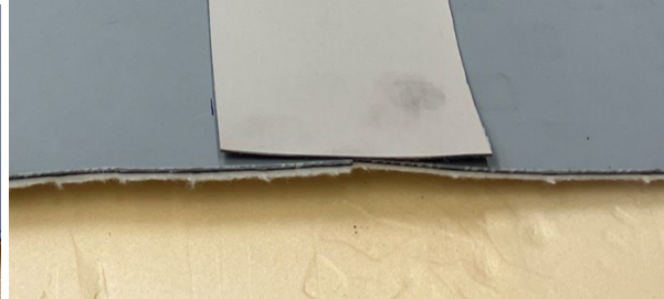
Figure 2 (butt joint)