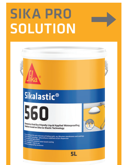
Size: 5 L and 20 L