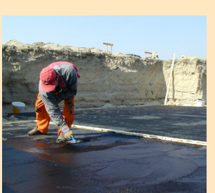
Below-Grade Structures Tank Lining