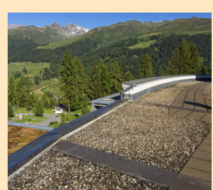
Gravel Ballasted Roofs