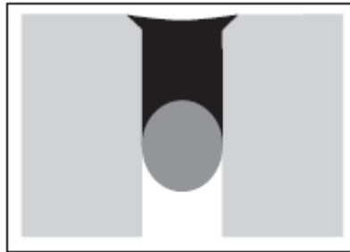
Flush joint design prevents trip hazards and dirt traps

Backing: Use closed cell, polyethylene foam backing rods.