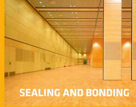
SEALING AND BONDING