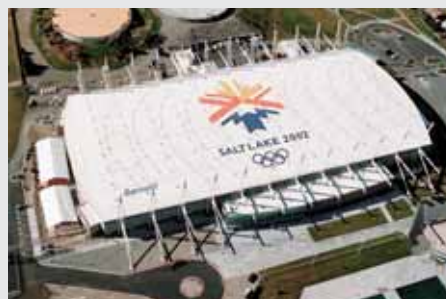
Utah Olympic Oval, Kearns, USA