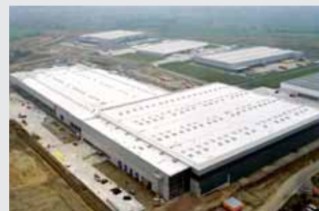
Walmart Distribution Centre, United Kingdom