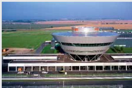
Porsche, Leipzig, Germany