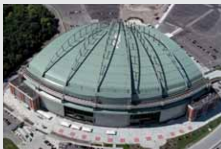
Miller Park, Milwaukee, USA

Sika's long term expertise and experience all over the world – for long lasting roofing solutions