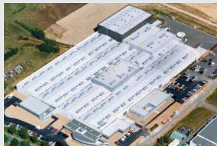
Industrial Building, France