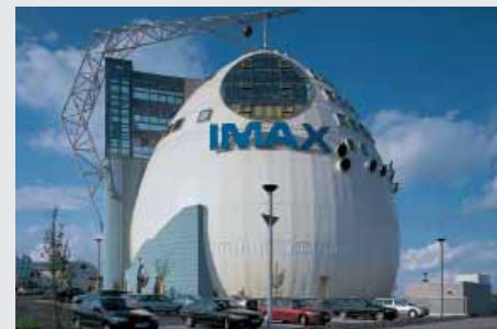
Imax Cinema, Cologne, Germany